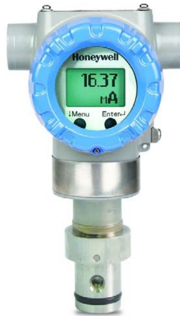
Figure 1 – STG73SP Flush Mount Gauge Pressure Transmitters feature field-proven piezoresistive sensor technology